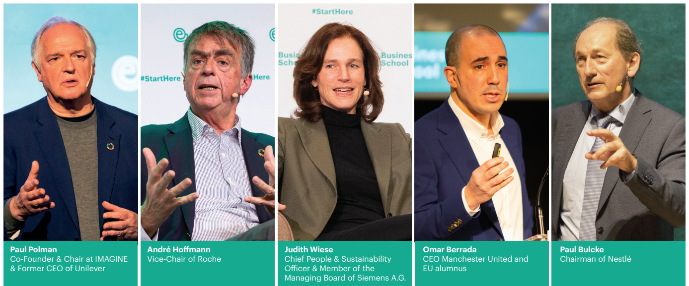
Paul Polman Co-Founder & Chair at IMAGINE & Former CEO of Unilever

EU Business School regularly invites some of the world's most eminent leaders to share their expertise with students.