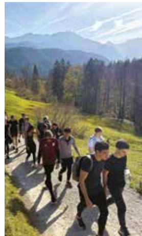
The Hiking Club