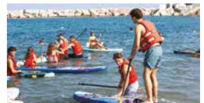
International Summer School