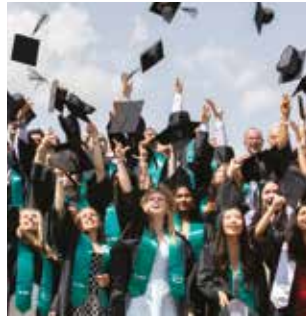
Commencement Ceremony Geneva