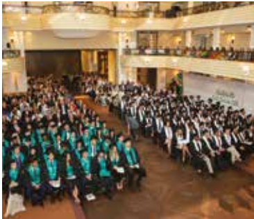
Commencement Ceremony Munich