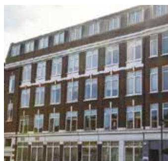
OMNES Education London School