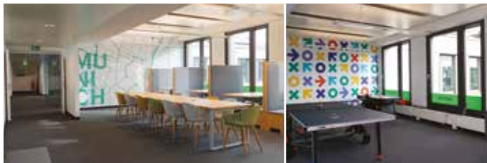
New Common Areas, Munich Campus