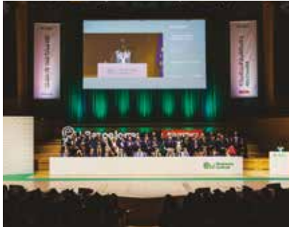
Commencement Ceremony Barcelona