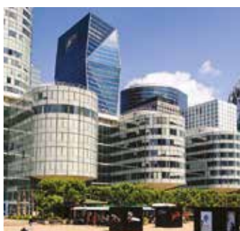
OMNES Education Paris School

Students broadened their global perspective through new international exchange programs with OMNES Education Group schools in London, Paris, Lyon, Bordeaux and Monaco.