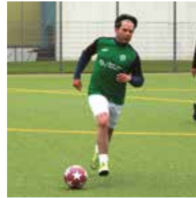
Sports on All Our Campuses

From hiking and skiing to social and networking events, students truly embraced the EU experience, creating unforgettable memories, connections and friendships.