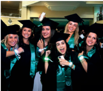
Commencement Ceremony Munich