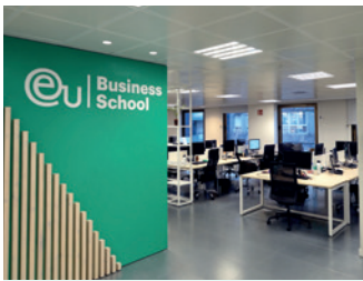
Diagonal Hub, Barcelona