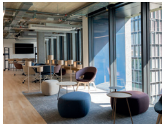
Pont Rouge, Geneva