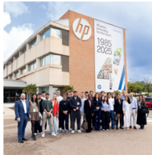
Company visit to HP