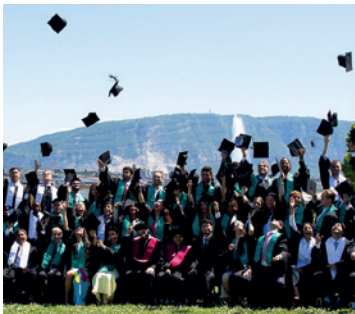
Commencement Ceremony Geneva