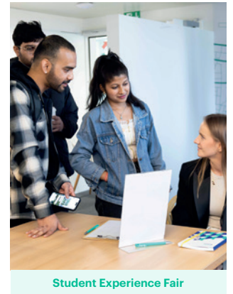
Student Experience Fair