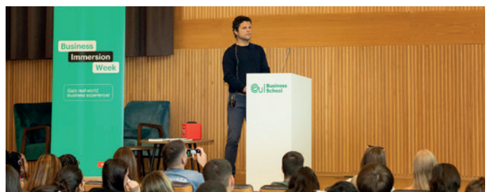
Guest speaker during Business Immersion Week