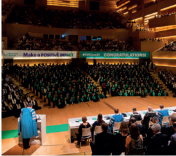
Commencement Ceremony Barcelona

We actively supported students on their professional journeys through Career Days and networking opportunities with top companies and celebrated their incredible achievements at our commencement ceremonies. Our alumni connected at events around the world, further strengthening our global network.